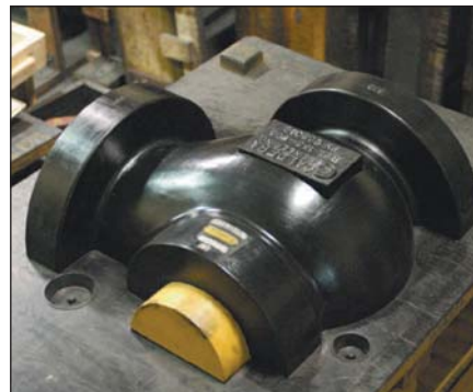
Fig. 2 — Wood patterns can be used to produce rammed graphite molds.